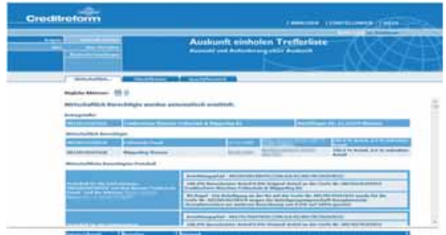
Graphical user interface of the CrefoSystem

of the required company, the system automatically establishes the benevolent owner(s) and provides full documentation of the search path.