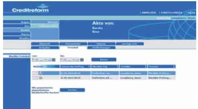
Graphical user interface of the CrefoSystem Web solution

Via an Internet browser, the CrefoSystem Web solution is used to check your business contacts against all the relevant sanction lists. The result of the verification is always returned in realtime.